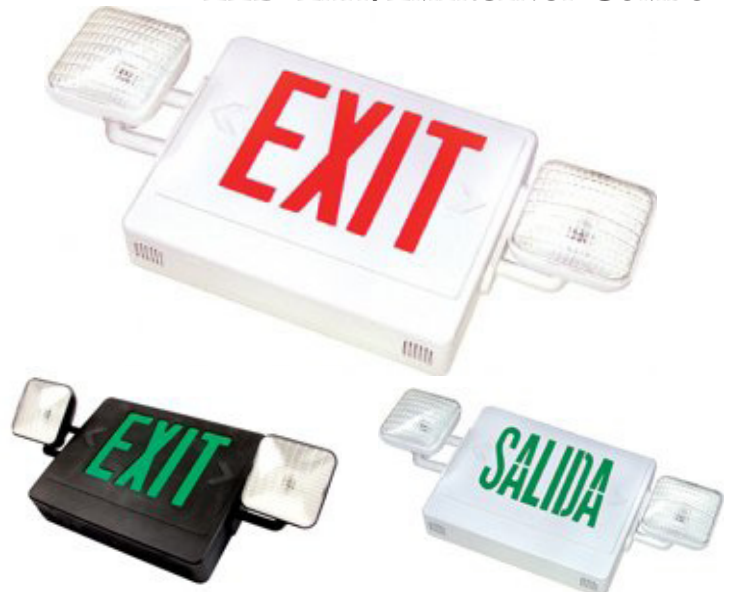
SALIDA faceplates also available